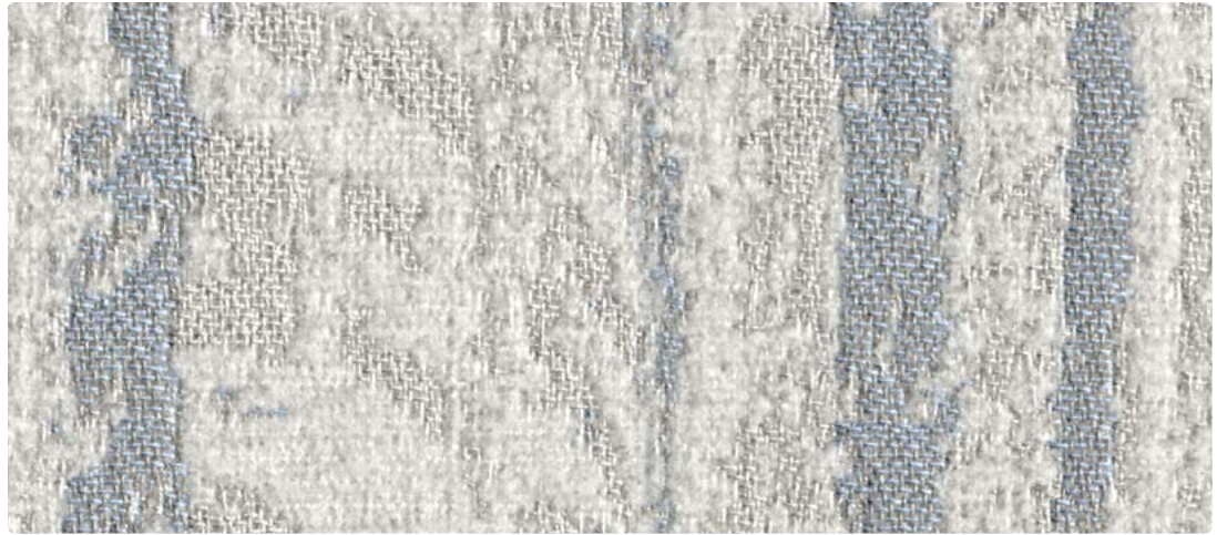
Snow Line 4129-06