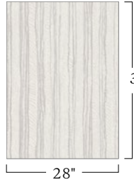
37.94" Graphic shows one full repeat.