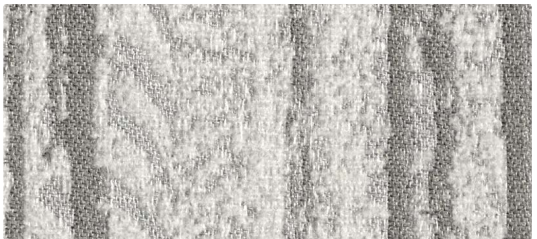
Boulder Clay 4129-02