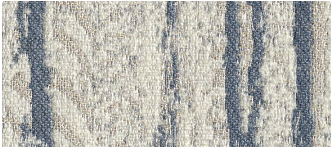
Sea Stack 4129-07