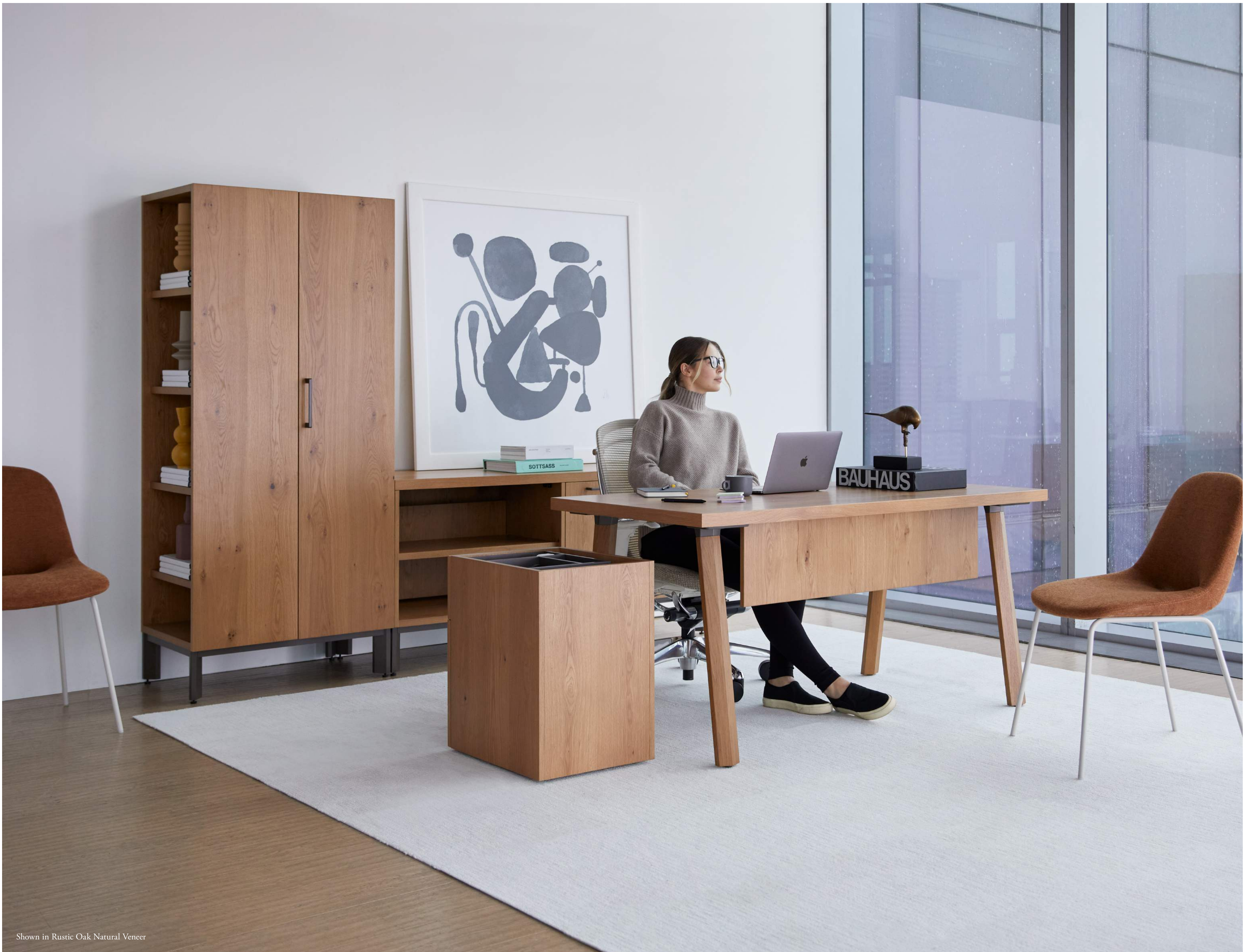
Shown in Rustic Oak Natural Veneer