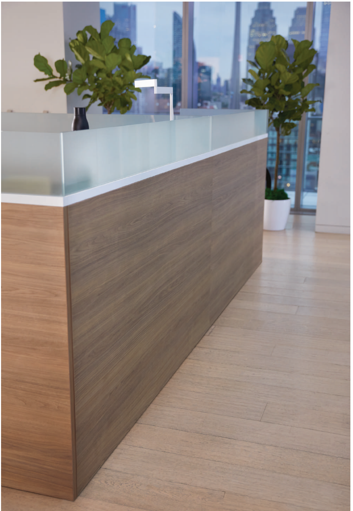
Power Spine Lateral Floor Screen with Return