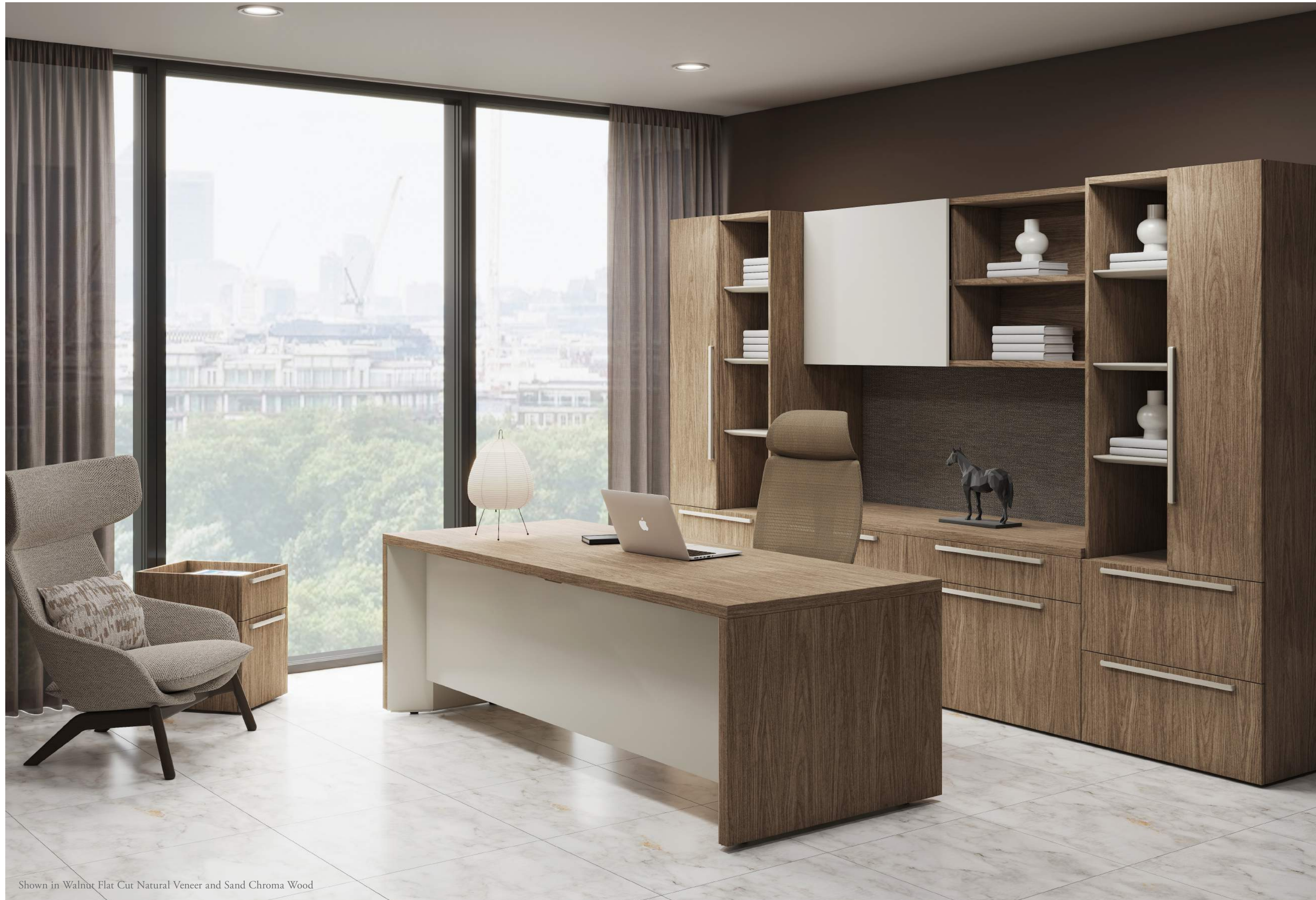
Shown in Walnut Flat Cut Natural Veneer and Sand Chroma Wood