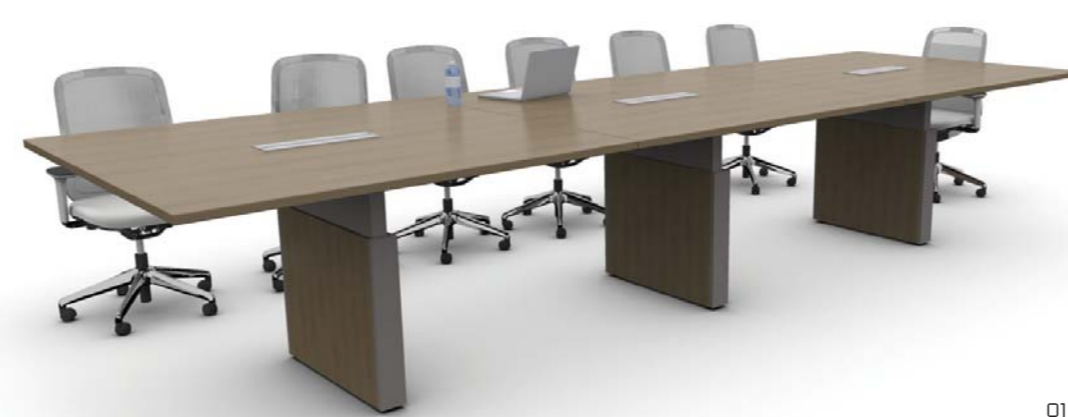
01 height-adjustable conference table with panel bases