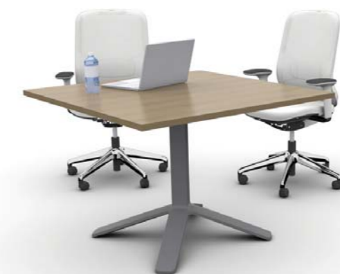
02 meeting table with new blade star base