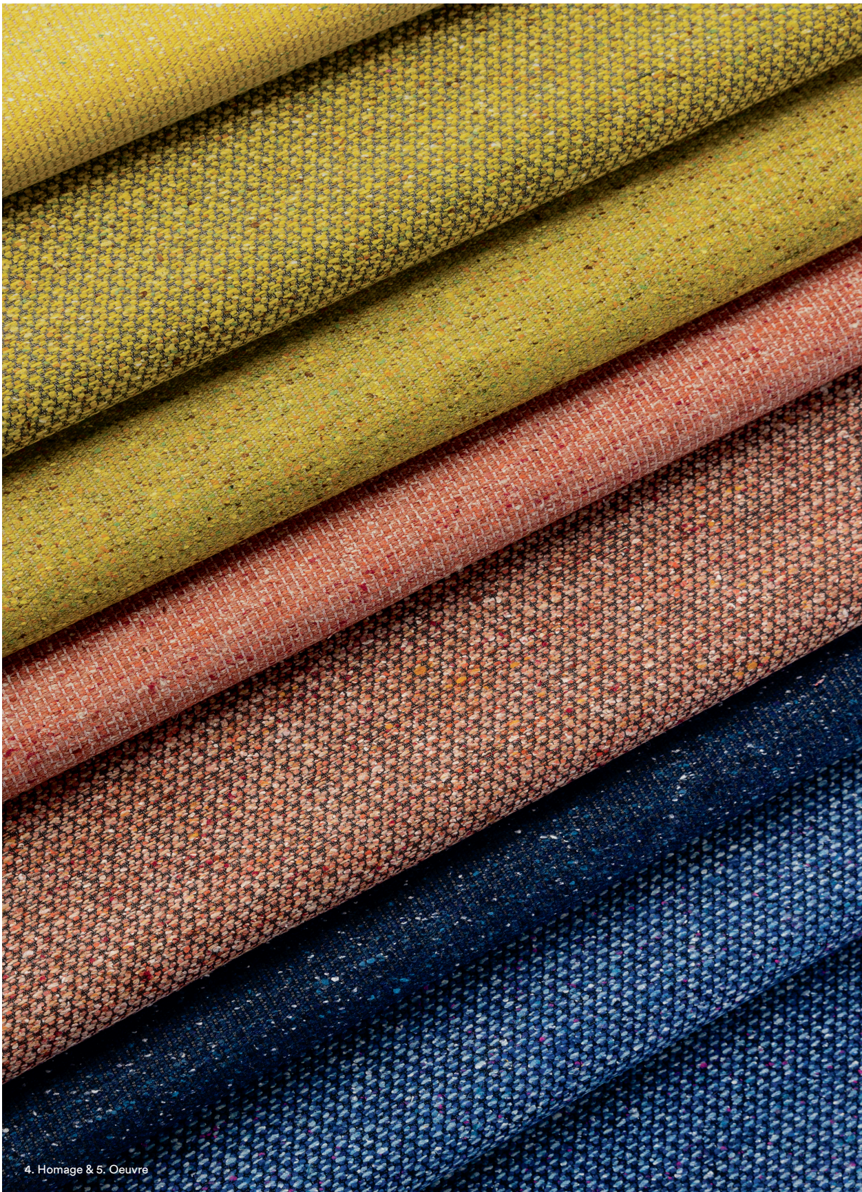
4. Homage & 5. Oeuvre