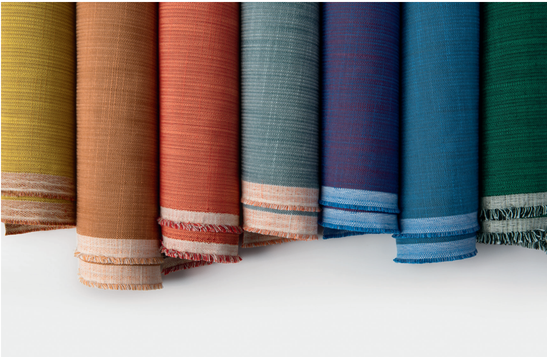
3. Duo Chrome