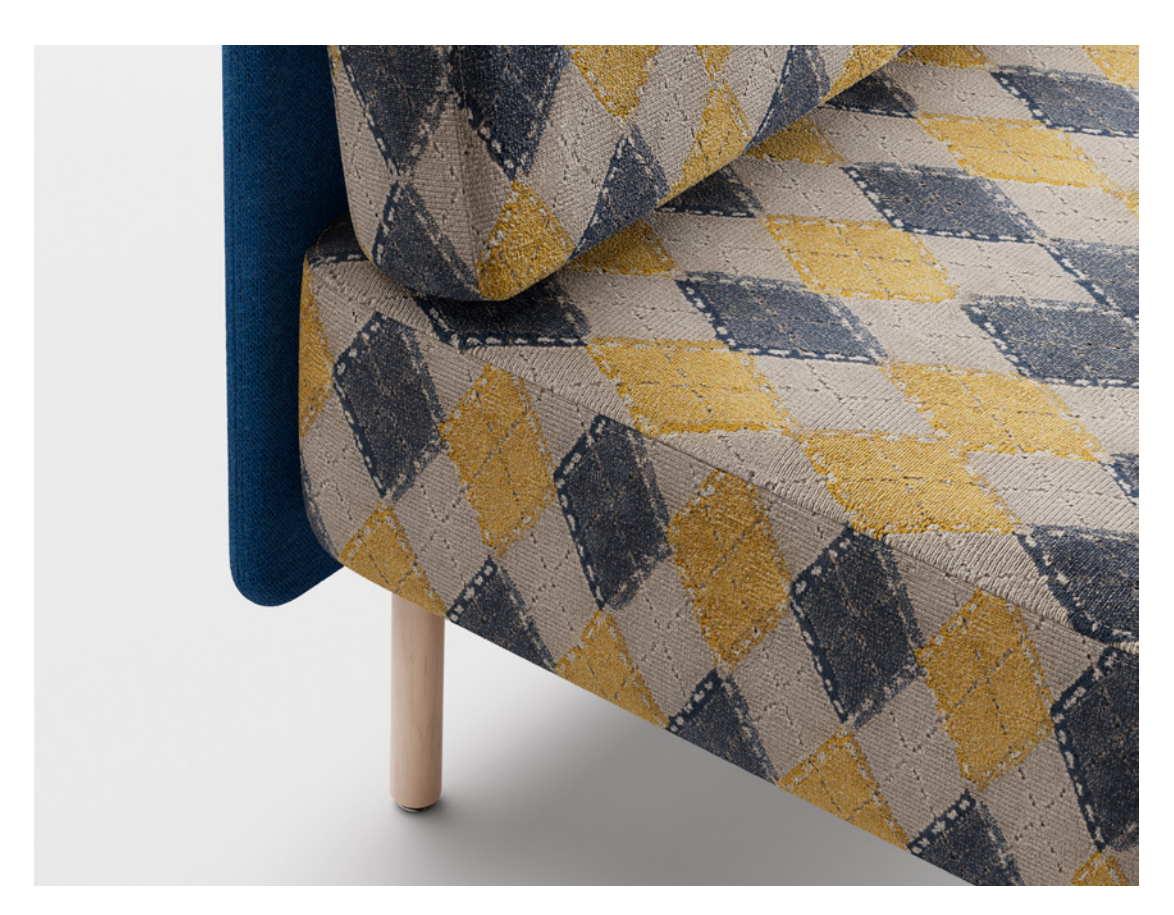
1. Oblique Argyle