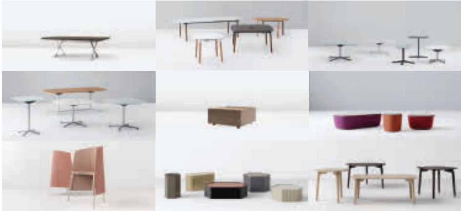
AC Executive Tables Bevy Pedestal Fractals Nook

A variety of TABLES across height, shape, and material