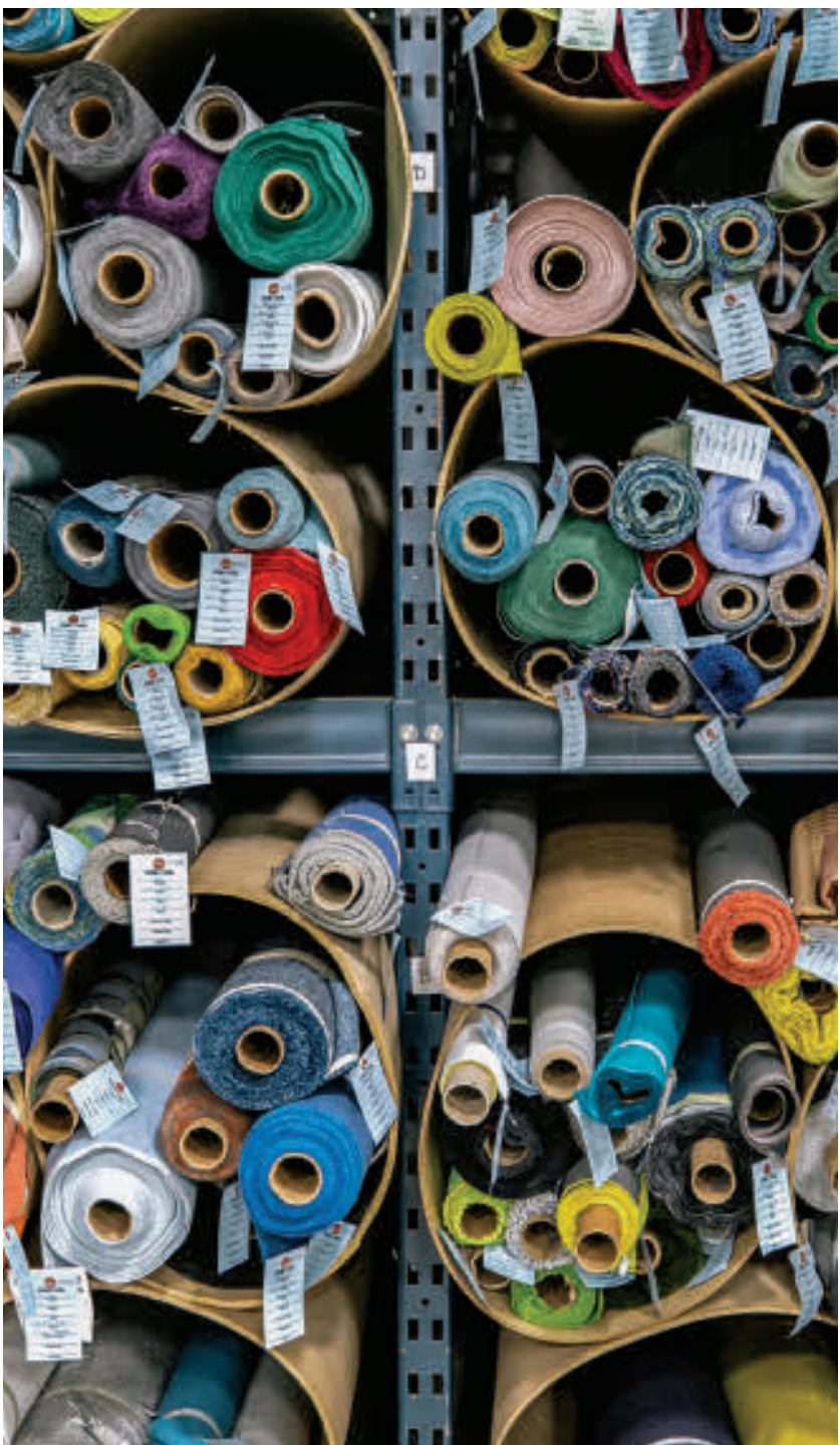
Uniting CRAFT through PARTNERSHIP and an INTEGRATED supply chain, for an endless array of UPHOLSTERY and FINISHES