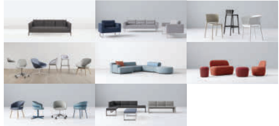
AC Lounge Beso Clip

A wide range of SEATING for a wide range of postures