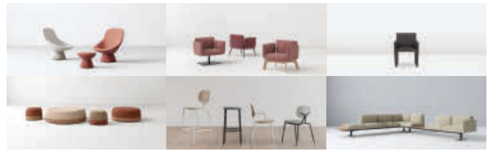
Pala Qui Ottomans

in three sizes, featuring a unique metal base and metal or wooden legs