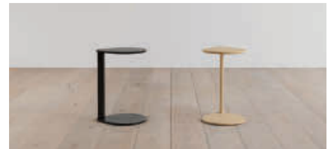
Task Table with a semicircular surface, cantilevered design, and a low-profile base