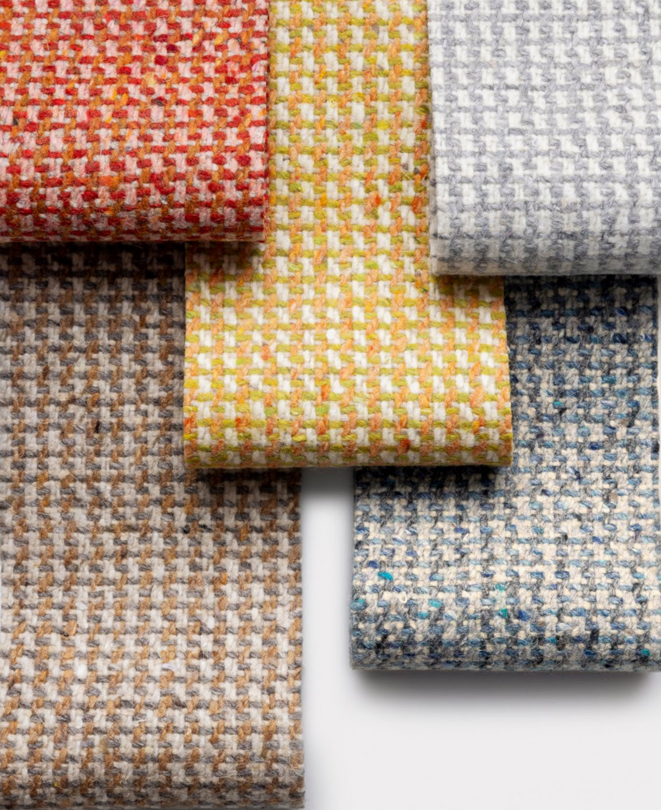
1. Graph Speck