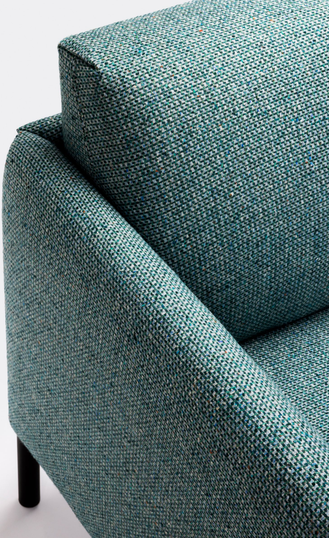
1. Graph Speck