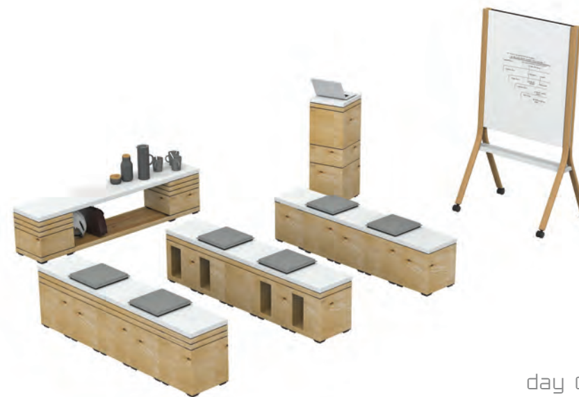
day 02: learning