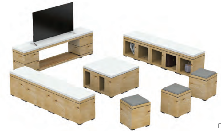
day 03: social / lounge

Versatile by nature, the collection functions equally well as fixed furniture as it does for multi-purpose spaces, shaping a room to support a number of different team tasks. Its flexibility makes it perfect for co-working spaces where tomorrow is always the unknown and activity changes day to day, creating environments that encourage lively dynamics and creativity. Build and rebuild, mix and remix to create just the right setting. Teknion Bene Box is always a work in progress.