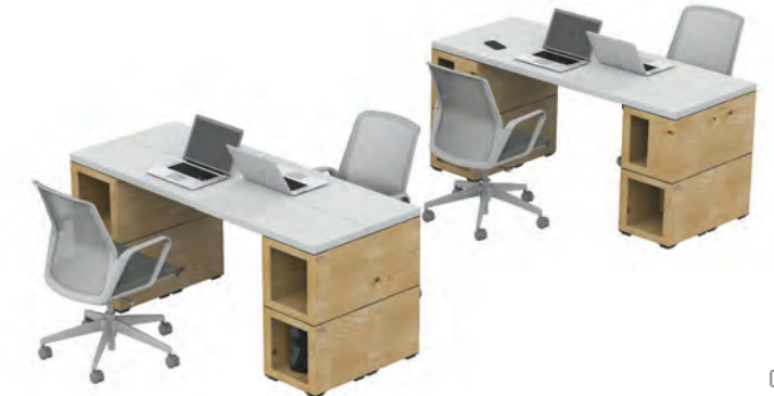
day 04: working