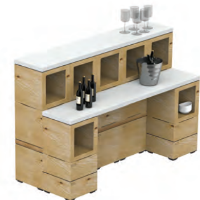
day 05: entertaining