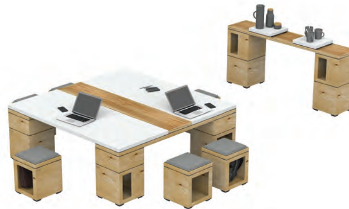
day 01: meeting