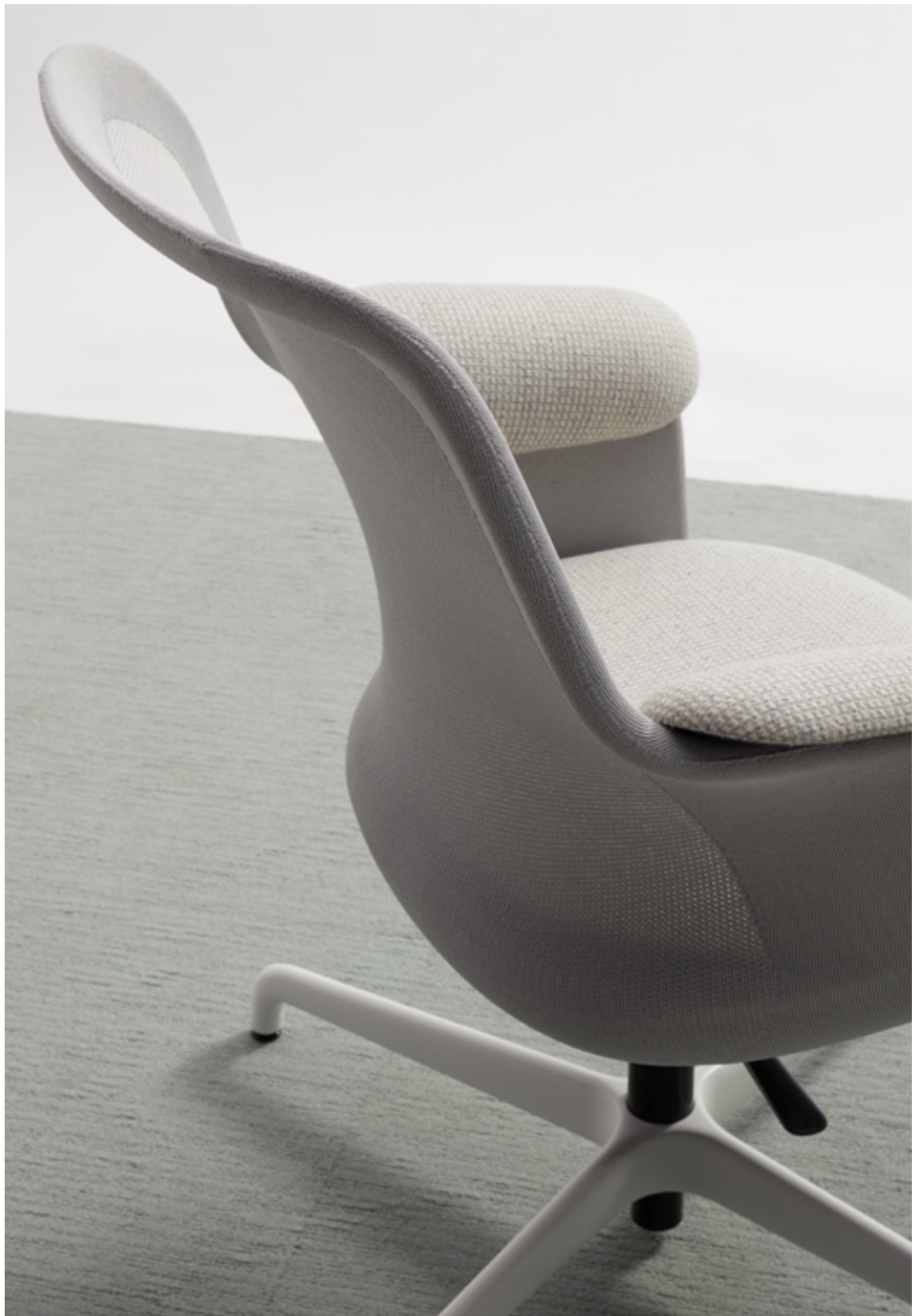
Area's curved contours.