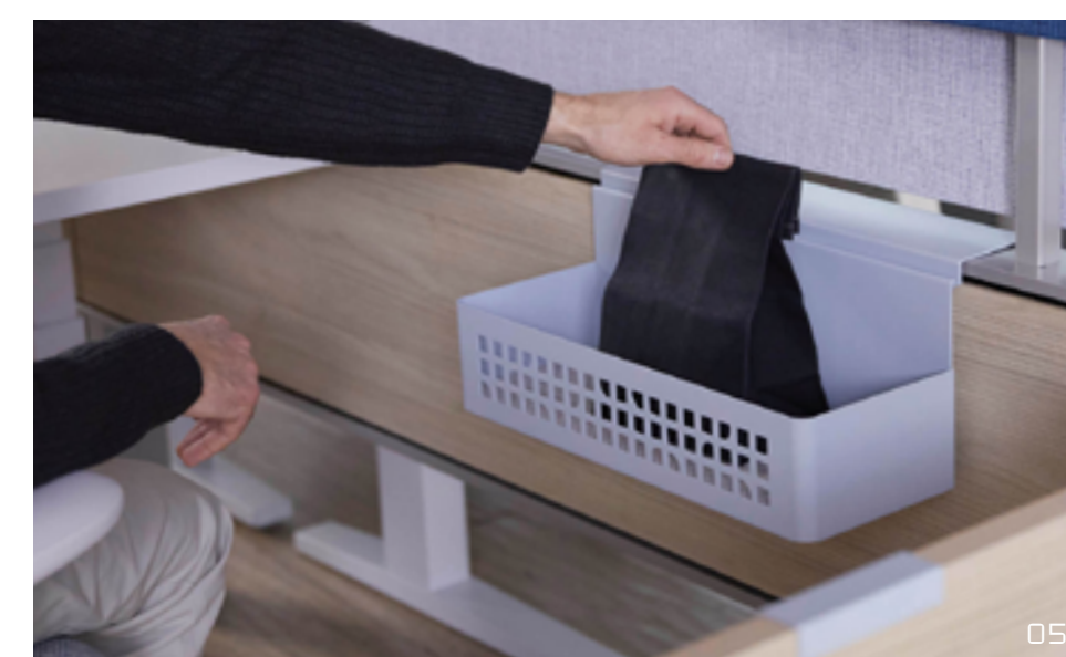
01 Accessory Organizer with Felt Pouch 02 PlanterAccessory 03 Accessory Hook 04 Desktop Organizer 05 Bucket Accessory