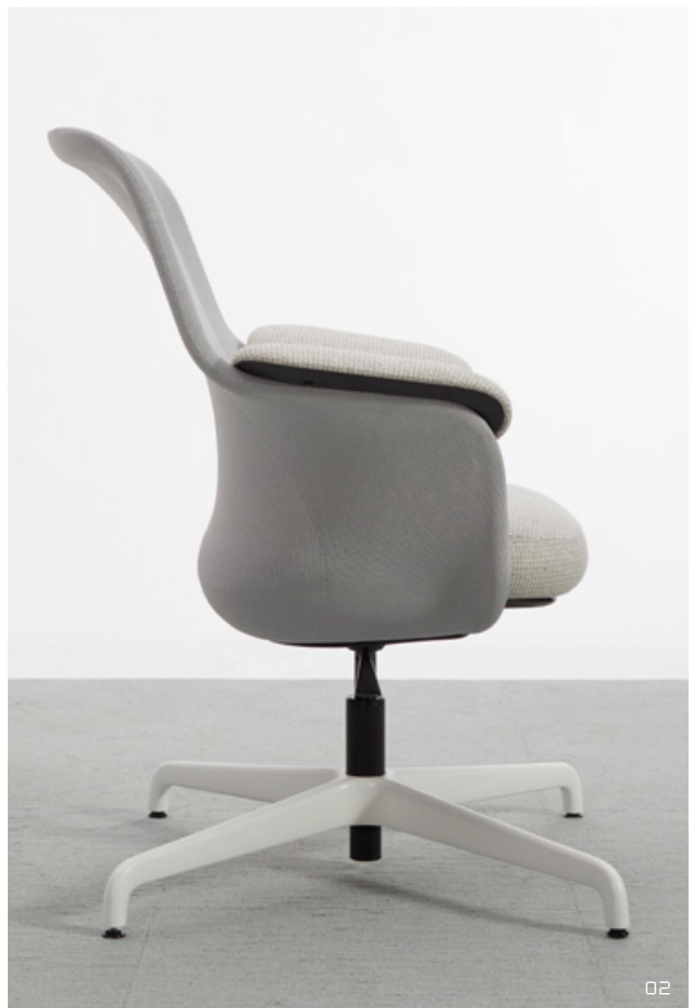
01 Angled arm rest for relaxed support 02 Curved contours with embedded ergonomics engineered into the knit

Aarea's mélangé knit back is fabricated from retrieved ocean litter to minimize virgin materials and waste. The knit back is flexible and readily conforms to the shape of the body, creating seamless support through the tensions inherent in the knit. The knit back is made to size, creating no additional cut off waste. A cushioned seat and angled armrests further enhance comfort and wellbeing for all users throughout a workday.