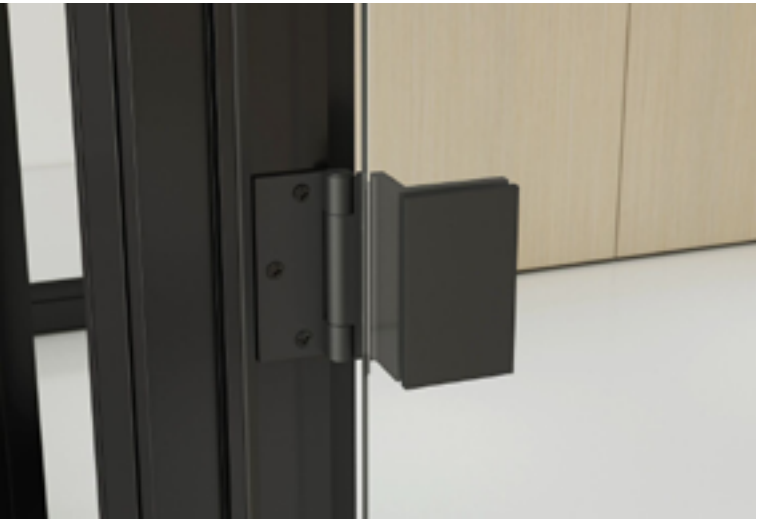
Glass Door Hinge