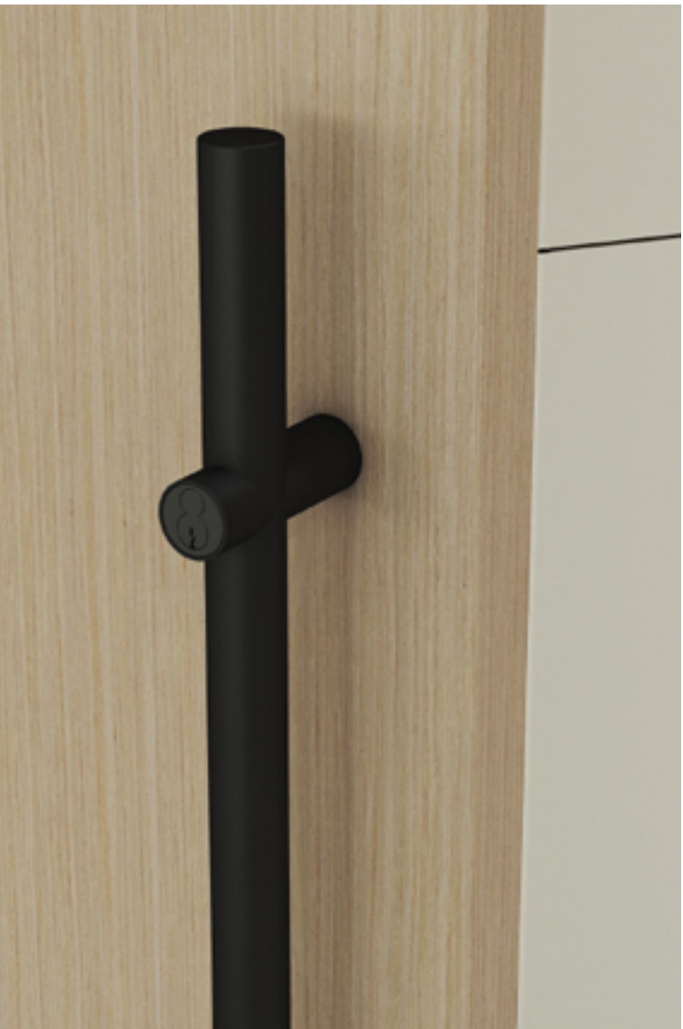
Floor Pull With Lock on Hinged Door