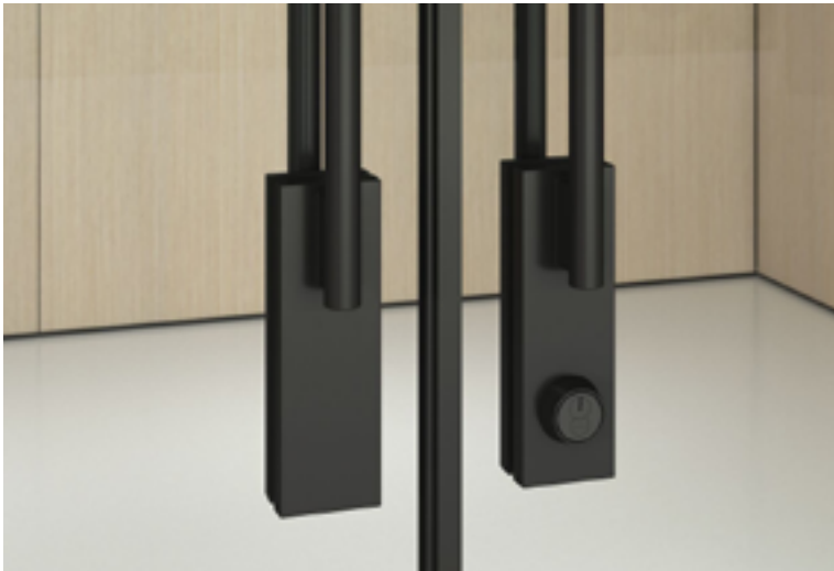
Double Sliding Door Ceiling Pull in Ebony