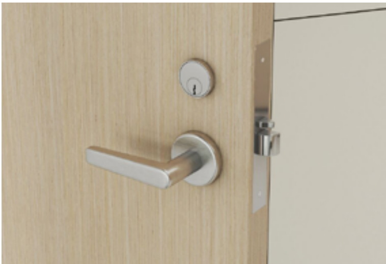
Lever Handle Lock in Anodized