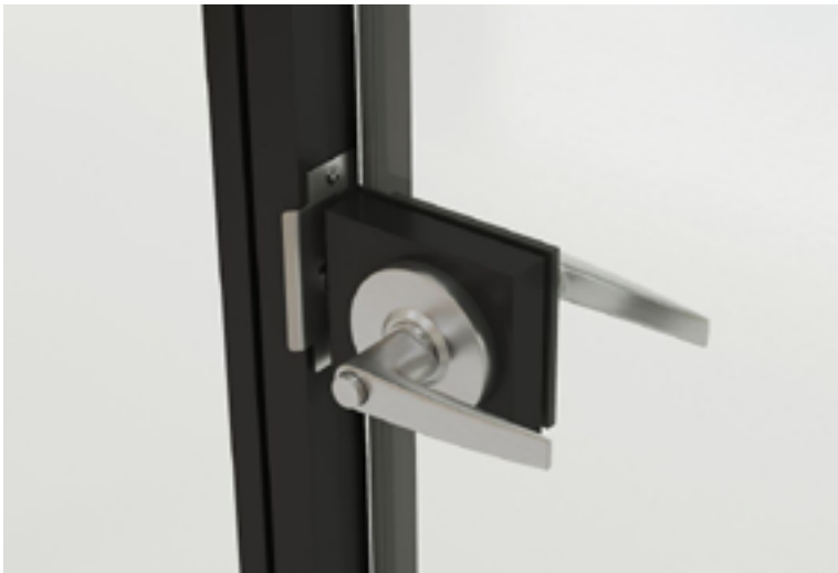
Lever Handle Lock in Anodized