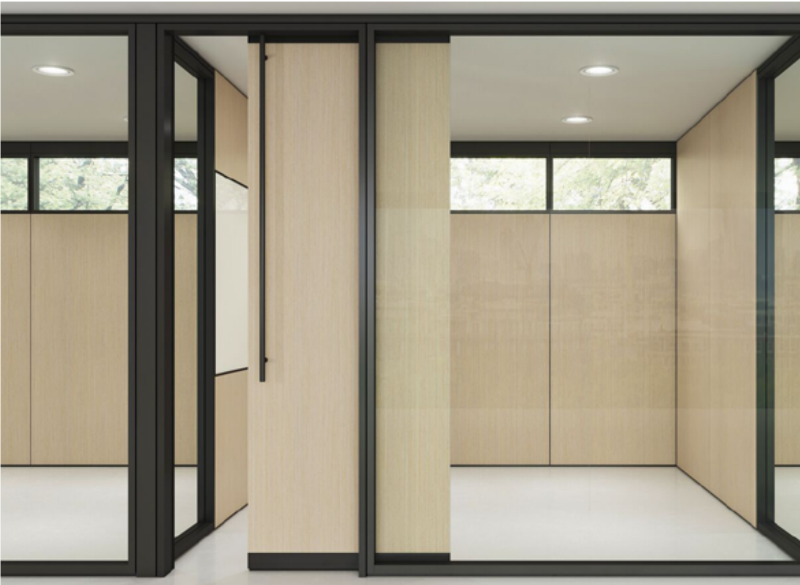
Single Sliding Door With Ceiling Pull