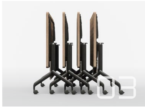
03 Angled legs create straight-line nesting for compact storage