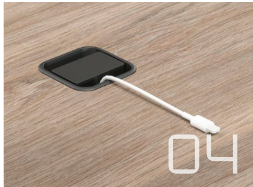
04 Optional power/data cut-out