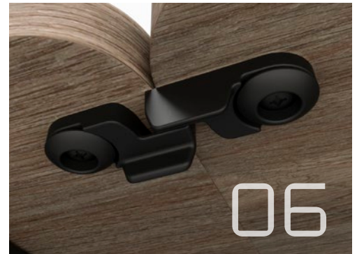
06 Linking device connects in all directions