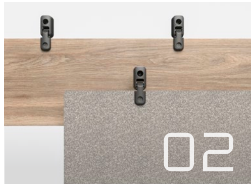
01 Intuitive surface-long handle with two-sided worksurface finish. Available 24" and 30" deep; 42" to 72" wide