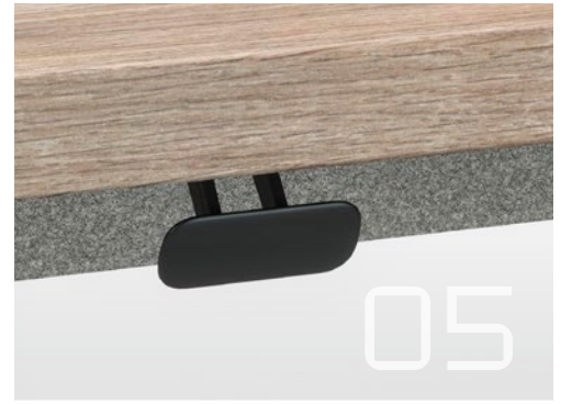
05 Optional bag hook mounts under the worksurface