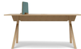
VWork High Table