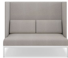
Pearson Lloyd Edge High Back