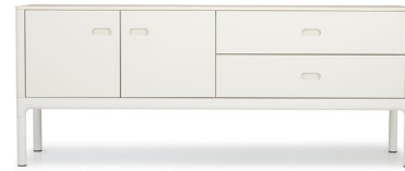
Pearson Lloyd Edge Storage