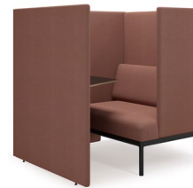
Pearson Lloyd Edge Single Booth