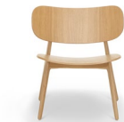
PLC Lounge Chair