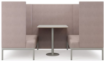
Pearson Lloyd Edge Booth