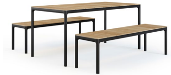
Pearson Lloyd Edge Outdoor