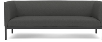
Pearson Lloyd Edge Sofa