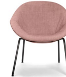
Lily Compact Chair