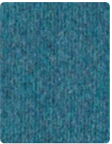
Glacial Lake 2010-15