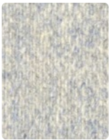
Morning Mist 2010-09