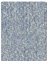
Soft Ice 2010-11