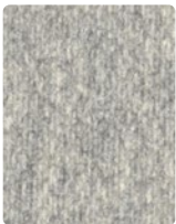
Gray Birch 2010-08